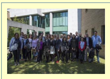
Joint picture in front of the IPP