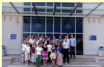
Joint picture in front of the SVEMO